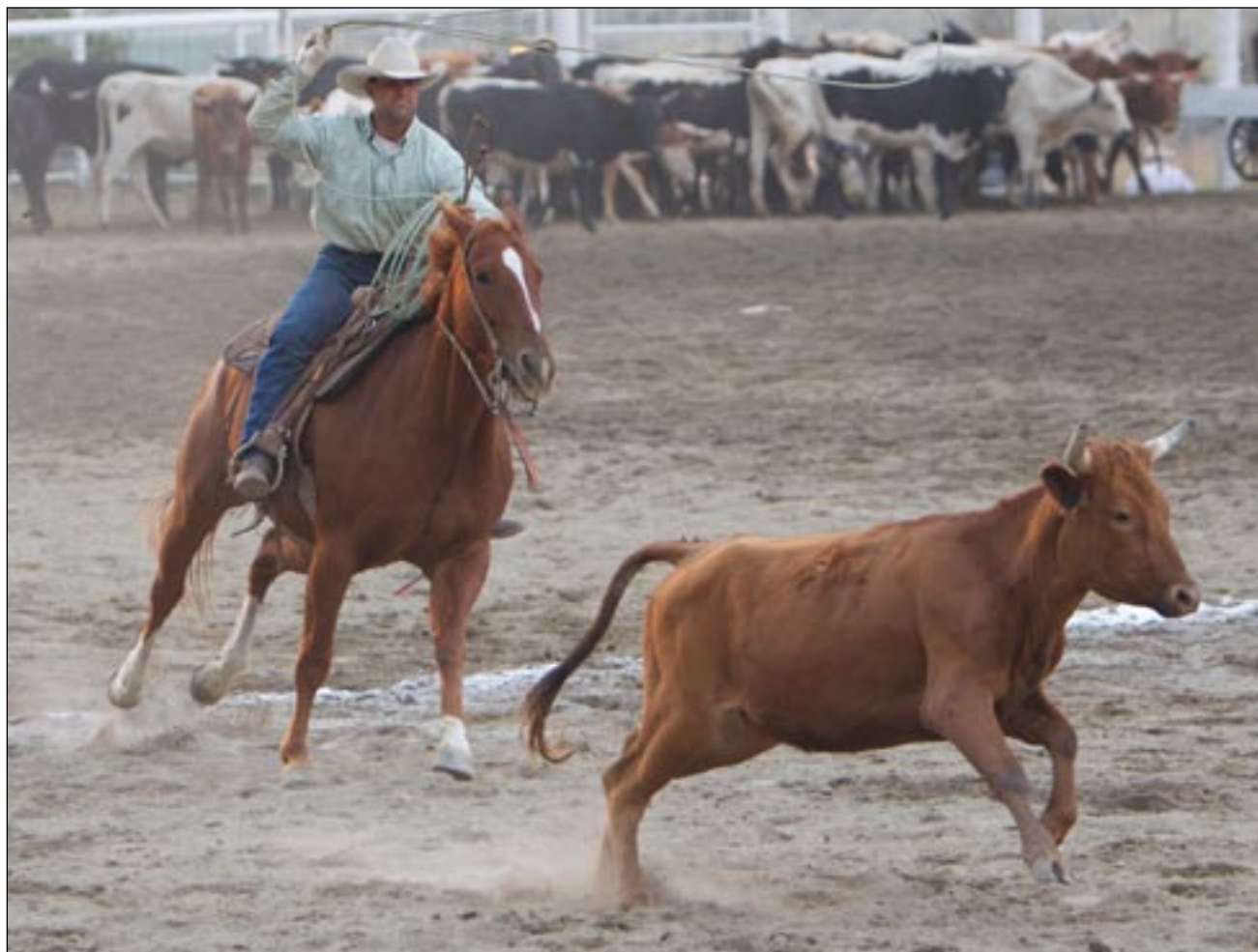
A cowboy throws a lariat during the 2013 ranch rodeo.